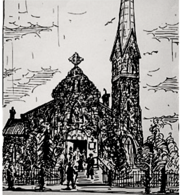
GRACE CHURCH 1945

“See what love the Father has given us, that we should be called children of God; and that is what we are.”