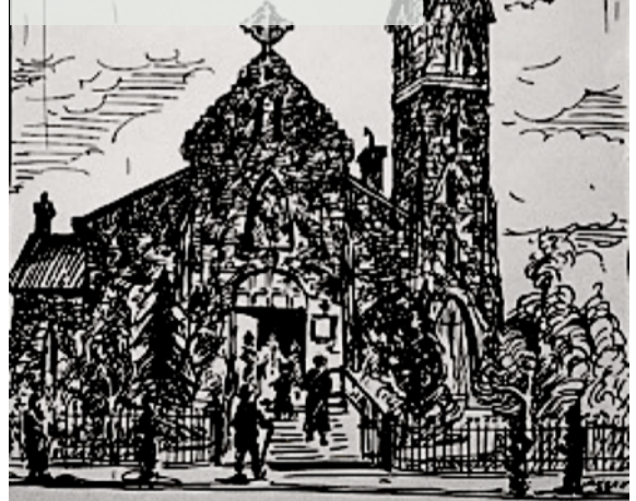
GRACE CHURCH 1948

Jesus answered, "The first is, 'Hear, O Israel ... you shall love the Lord your God with all your heart and with all your soul, and with all your mind, and with all your strength.' The second is this, 'You shall love your neighbor as yourself.' There is no other commandment greater than these."