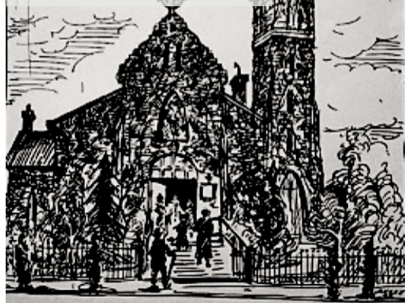
GRACE CHURCH 1948

"On the first day of the week, at early dawn, the women who had come with Jesus from Galilee came to the tomb, taking the spices that they had prepared. They found the stone rolled away from the tomb, but when they went in, they did not find the body."