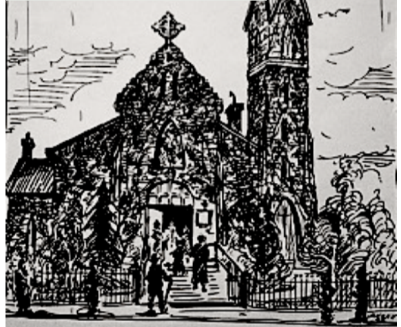
GRACE CHURCH 1948

"I give you a new commandment, that you love one another. Just as I have loved you, you also should love one another. By this everyone will know that you are my disciples, if you have love for one another."