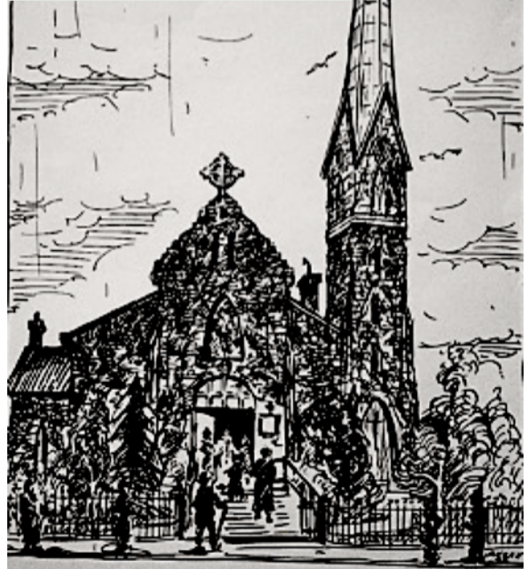
GRACE CHURCH 1948

They said to each other, "Were not our hearts burning within us while he was talking to us on the road, while he was opening the scriptures to us?"