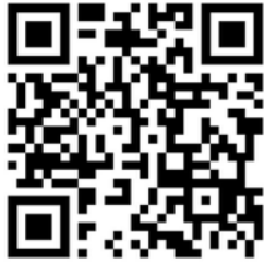
Giving Page QR Code

“...whoever does not take up the cross and follow me is not worthy of me. Those who find their life will lose it, and those who lose their life for my sake will find it.”