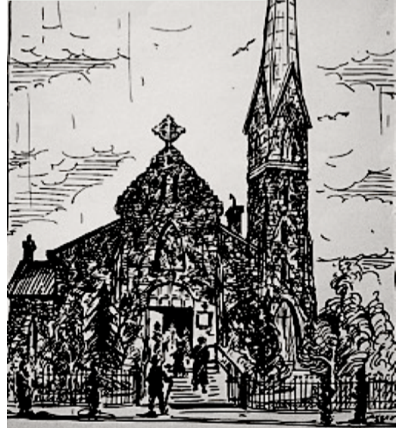
GRACE CHURCH 1948

“...whoever does not take up the cross and follow me is not worthy of me. Those who find their life will lose it, and those who lose their life for my sake will find it.”